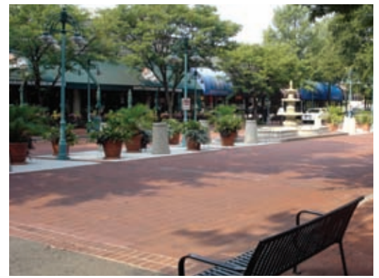
A formal fountain and seasonal plantings create an air of sophistication for this mixed-use retail street in Alexandria, Virginia.