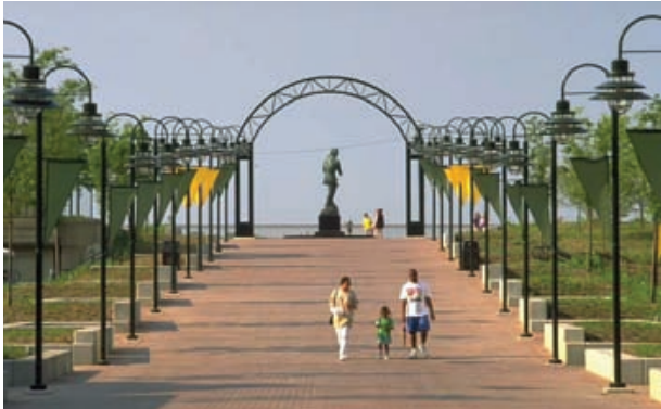
Strategic placement of public art at the top of this urban plaza creates a focus and an attraction for visitors.