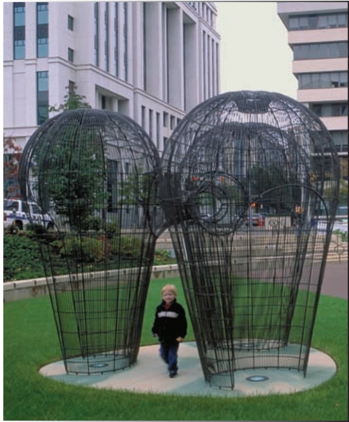
Sculpture can encourage people to interact with public space.