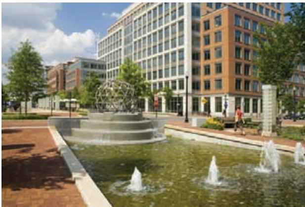
Public art allows people to feel a sense of ownership.