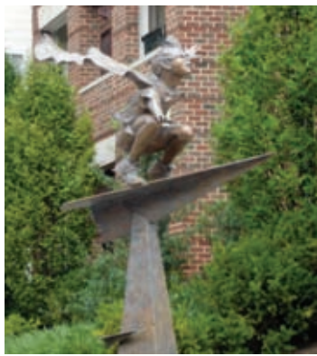
Public art contributes a carefree sense of fun to a neighborhood park.