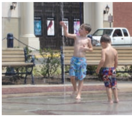
This children’s fountain plaza is an example of interactive public art.